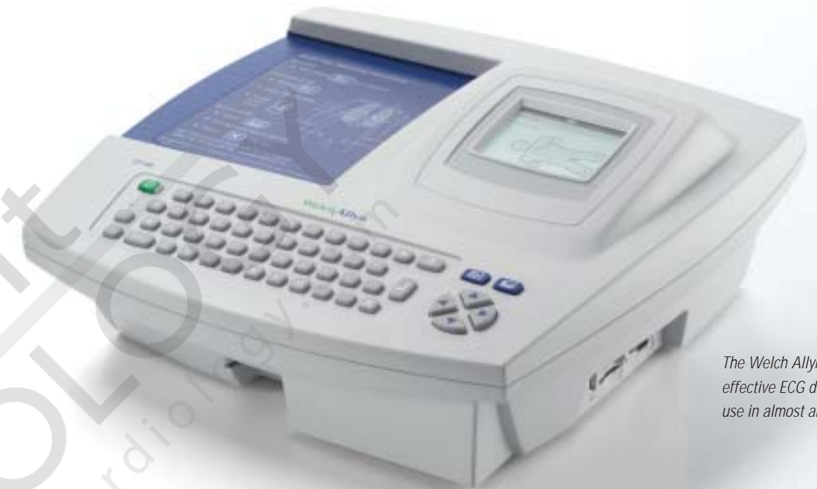
The Welch Allyn CP 100 is a cost-effective ECG device designed for use in almost any office setting

Introducing a new family of multichannel electrocardiographs that are flexible enough to work in any setting. These reliable, easy-to-use devices were designed using proprietary Welch Allyn technology to make taking ECGs a snap. With an intuitive design and advanced software features, these EMR-ready devices can help make your practice more efficient by allowing you to quickly administer patient tests and manage patient information.