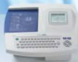
Welch Allyn CP 100™