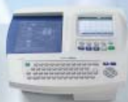
Welch Allyn CP 200™