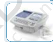
Welch Allyn CP 200™ Transfer information via direct connection or SD card