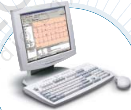
Welch Allyn CardioPerfect™ Workstation Software

The Welch Allyn CP 200 with optional spirometer utilizes one platform for two different testing applications. You'll enjoy all the benefits of a full-featured ECG and spirometer with data organized in the same fashion to make it easier to manage.