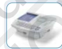
Welch Allyn CP 100™ Transfer information via SD card

Transfer test data and patient information to individual patient records in your EMR for analysis and permanent storage