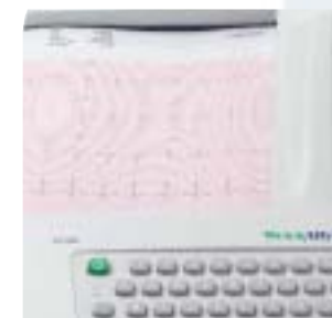
Customizable Report Formats Prints the chart-sized reports you want in the format that works best for you and your staff