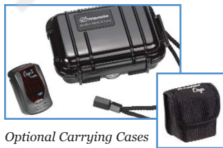
Optional Carrying Cases

Please contact your authorized distributor for more information.