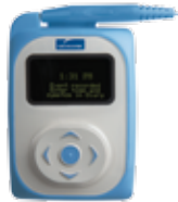
IQholter™, EX, EP