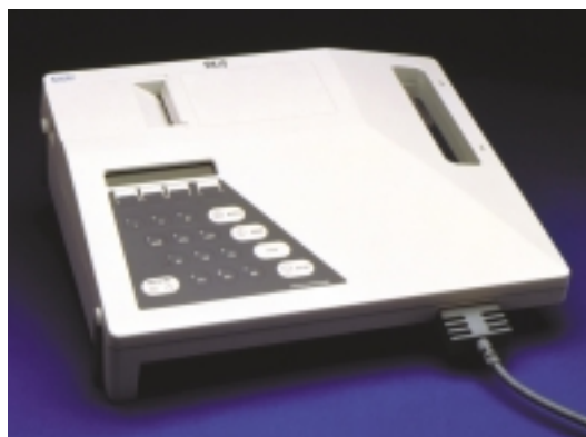
The EK-10 offers simple, one-touch button operation

The thermal array printer provides reports in a single channel format. With our Assurance® fade free paper, you'll get excellent trace quality for accurate diagnosis.