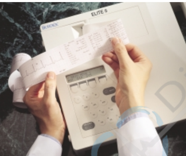
The Elite II provides simultaneous acquisition and analysis on all 12 leads

When your practice calls for a simple solution for routine ECG testing, look to Burdick for single-channel electrocardiographs. They feature easy-to-use interfaces and are ideal for private offices and smaller clinics. Plus minimal maintenance requirements will help you keep a smooth running practice.