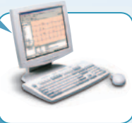
Welch Allyn CardioPerfect Workstation Software