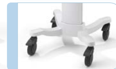
Model Shown here with hospital-grade wheel option

Contact your local Welch Allyn representative or visit www.welchallyn.com/CP150 today for more information.