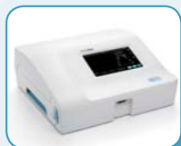
Welch Allyn CP 150 Transfer information via USB or Ethernet