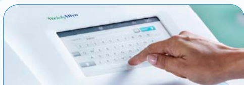
TOUCH SCREEN KEYBOARD

No need to track between the display and keyboard, saving time and helping reduce errors.