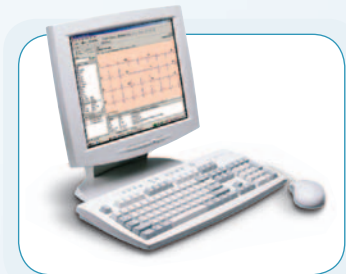
Welch Allyn CardioPerfect Workstation