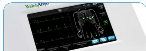
LEAD QUALITY DISPLAY

No need to track between the display and keyboard, saving time and helping reduce errors.