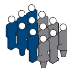
Americans 65 and older Number of Americans over 65 with some form of disability