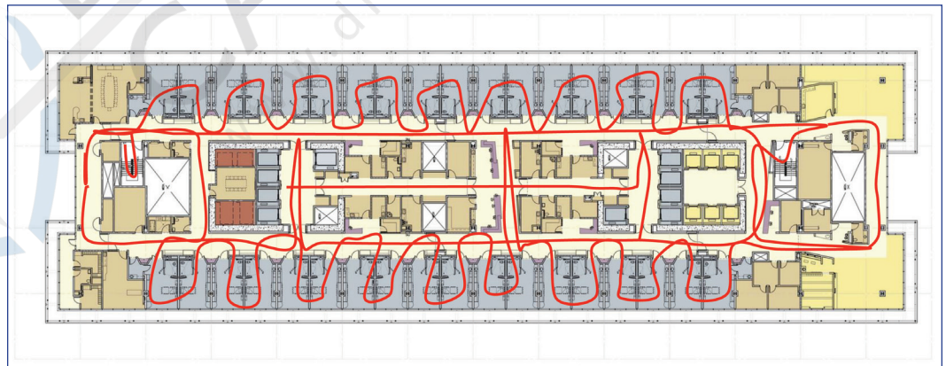
Example of marked up hospital floor plan, highlighting all places where patients will be monitored

Based upon an understanding of the medical device’s network characteristics and the existing network infrastructure, an accurate WLAN design can be initiated. The design tasks may include creating a completely new design or modifying the existing WLAN. This design can be then be handed off to the hospital’s integrator for any potential remediation and/or additional infrastructure.