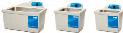
M550, M250 and M150 Soniclean® Ultrasonic Cleaners

9A404001 - Top Cover Protector 9A402001 - Door Tray 9A401001 - Printer