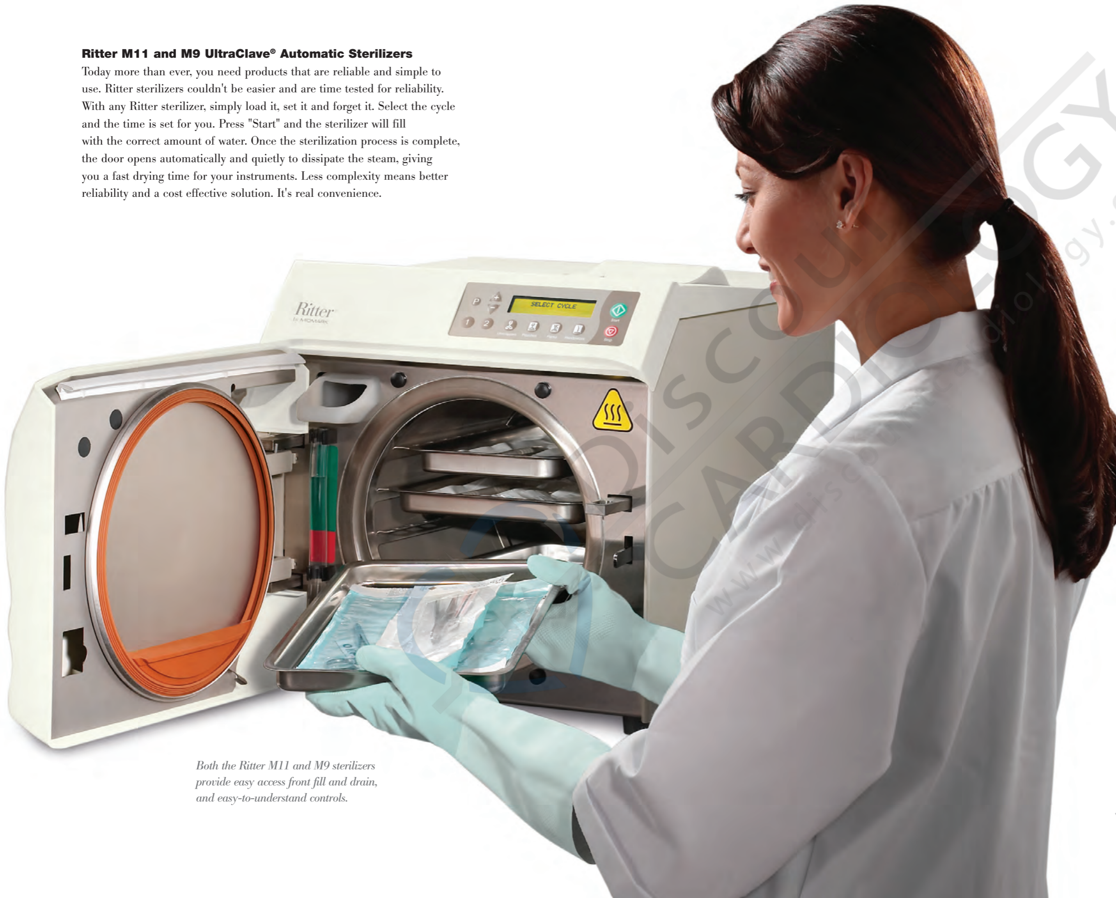
Both the Ritter M11 and M9 sterilizers provide easy access front fill and drain, and easy-to-understand controls.

Today more than ever, you need products that are reliable and simple to use. Ritter sterilizers couldn't be easier and are time tested for reliability. With any Ritter sterilizer, simply load it, set it and forget it. Select the cycle and the time is set for you. Press "Start" and the sterilizer will fill with the correct amount of water. Once the sterilization process is complete, the door opens automatically and quietly to dissipate the steam, giving you a fast drying time for your instruments. Less complexity means better reliability and a cost effective solution. It's real convenience.