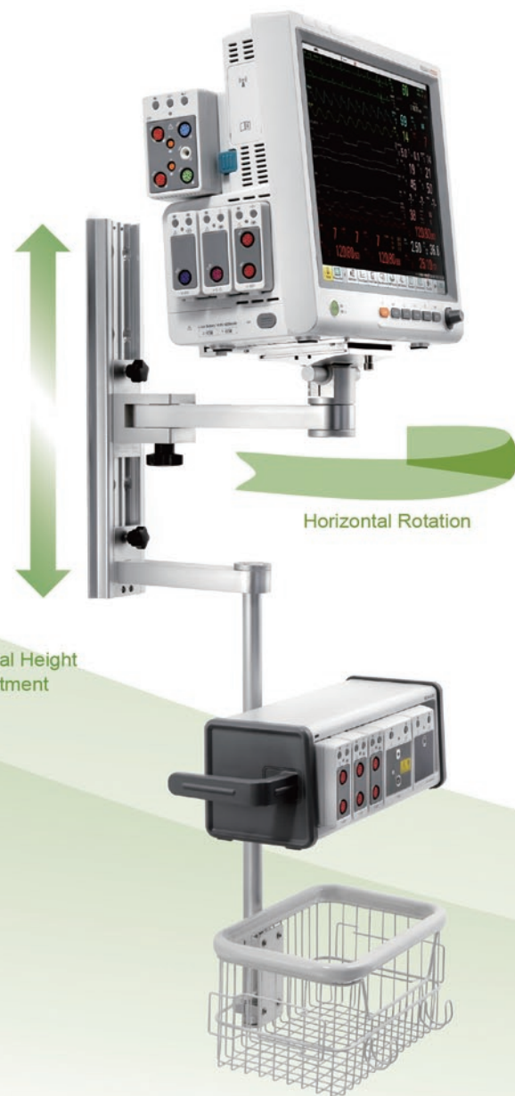
Vertical Height Adjustment