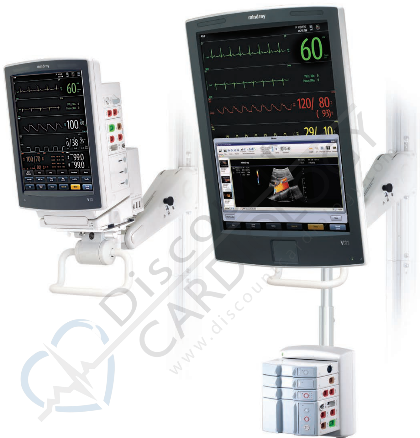
Available in two color TFT touchscreen display sizes: V12 and V21