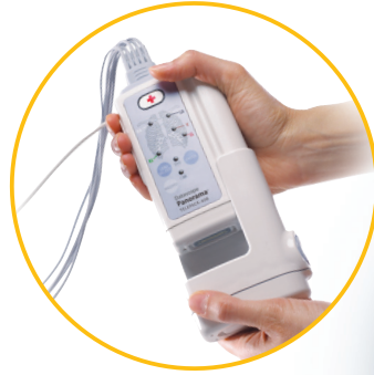
Optional SpO 2 module

Available with optional SpO 2 monitoring module.