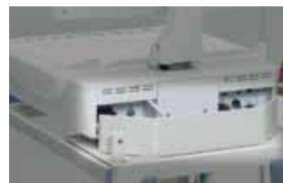
With connector cover