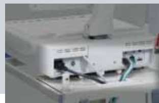
Without connector cover