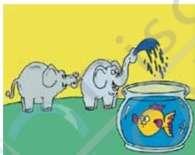
Pediatric Incentive Animations