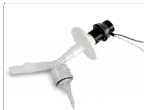
Integrated dosimeter for automatic broncho-challenge tests