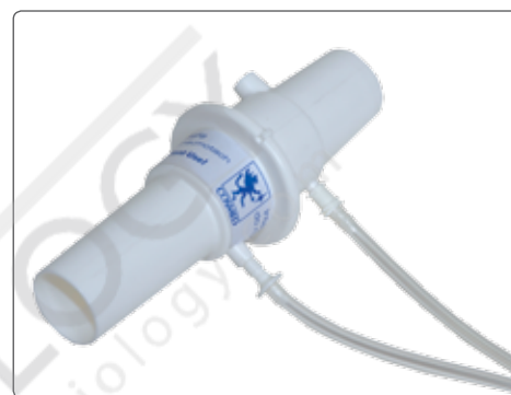
"Flowsafe", single use pneumotach