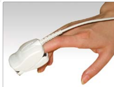
Pulse oximeter for SpO 2 saturation measurements