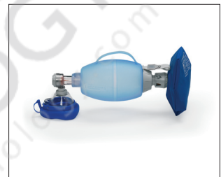
Ambu Silicone Face Mask connected to Ambu Silicone Resuscitator

Discount CARDIOLOGIST www.discountcardiologist.com