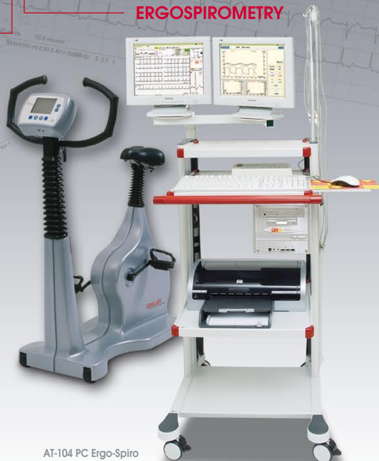
AT-104 PC Ergo-Spiro