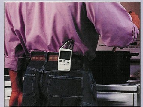
The lightweight, portable Trio*Stim is small enough to travel anywhere.