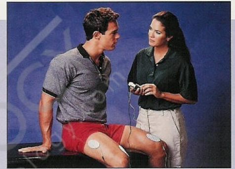
Three programmable modes provide unprecedented treatment flexibility from a portable unit.