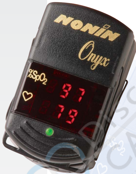
Shown larger than actual size