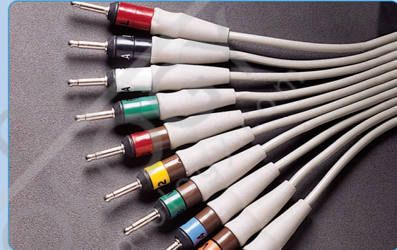
Everything about the PageWriter 100 makes ECG recording easy, including its patient cable which reduces lead tangling and quickens patient prep.