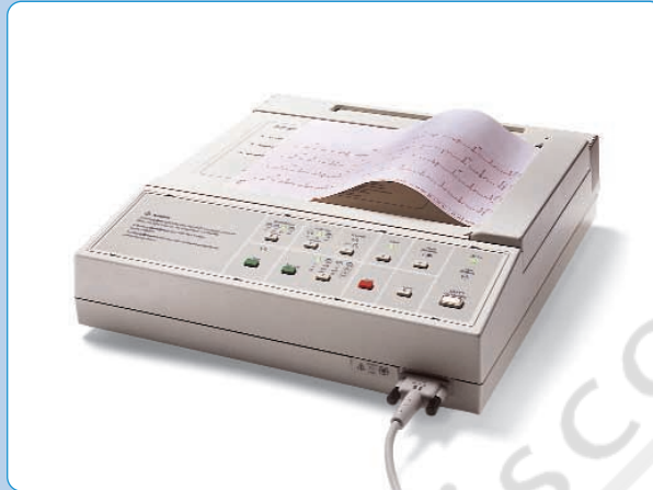
The Philips PageWriter 100 gives you the portability you need without compromising the features and functions essential for high-quality ECG recordings.