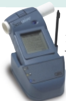
The base station allows you to easily dock and recharge your Sensaire.