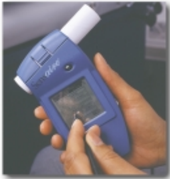
Test patients quickly with touchscreen technology

QRS introduces the newest member of our spirometer family — Sensaire pocket spirometer. Several powerful features combine to create the perfect full-function spirometer for mobile healthcare practitioners.