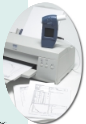
Print reports from Sensaire directly to a printer or through PC Print software.

*Specifications subject to change without notice.