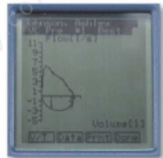
View real-time Flow Volume Loop graphs