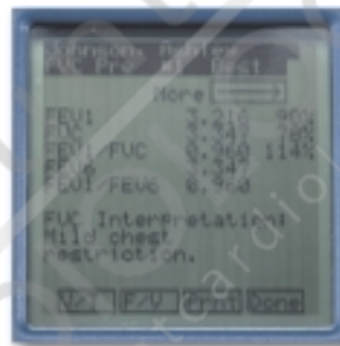
Test results are clearly displayed for easy interpretation