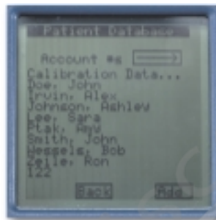
Access complete patient information with a touch of the screen