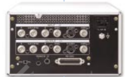
UP-21MD Back Panel