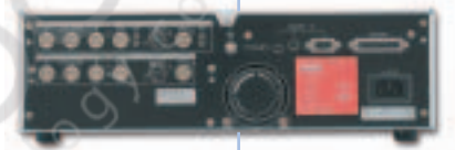
UP-51MD Back Panel